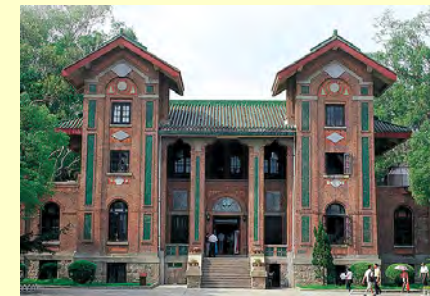
Huai-shi Hall in Sun Yat-sen University